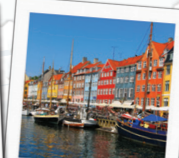
Copenhagen 13:05 Walking to meet a new system integrator