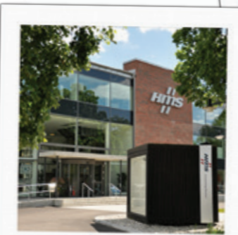
Halmstad 12:15 Presenting a new product concept to the HMS global team