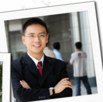
Beijing 14:12 Distributor conference