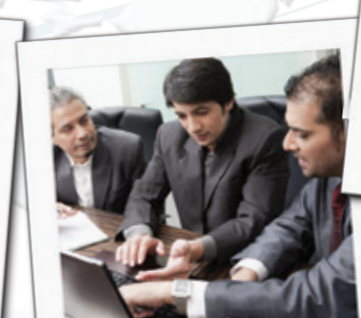
Pune 16:10 Discussing how to connect a product to EtherNet/IP