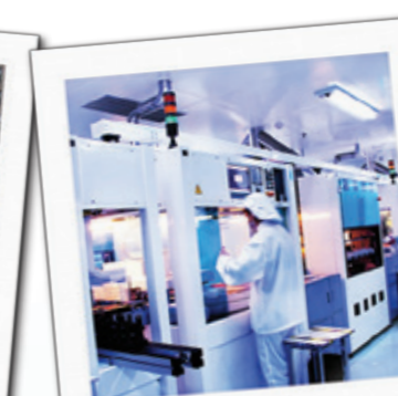
Coventry 17:00 Installing network connectivity for medical equipment