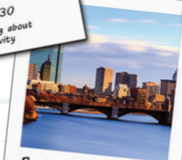
Boston 07:52 Meeting with customer to discuss product customization