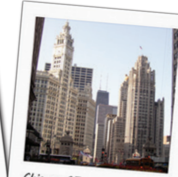
Chicago 07:52 On the way to a customer meeting