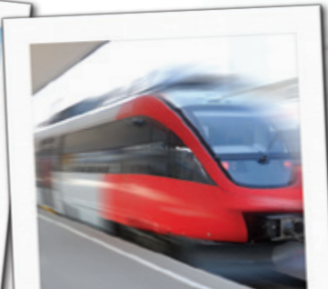
Karlsruhe 09:09 On a train to a telecom conference