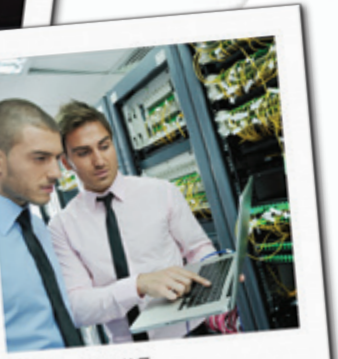
Milan 11:45 Technical support with a system integrator