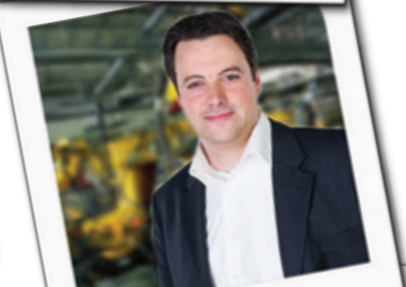
Weingarten 13:30 Customer meeting about machine connectivity