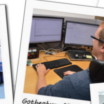
Gothenburg 19:15 Developing connectivity for PROFINET IRT