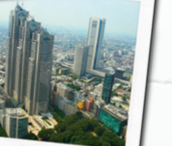
Tokyo 16:40 Preparations for an industrial tradeshow