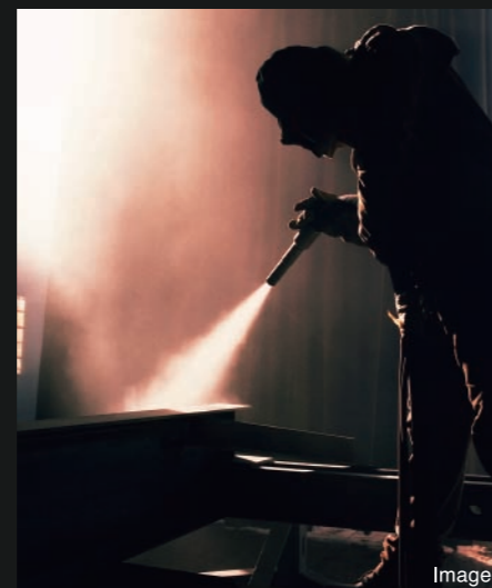
IP69K (80°C Jet-stream Steam Examination) (Standard Number / DIN 40 050-9)

Steam jet injection (80-100 bar at a temperature of 80°C) is applied at angles of 0, 30, 60, and 90 degrees at a distance from 100-150mm repeated 5 times at a duration of 30 seconds without being affected by any harmful influences.