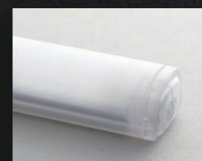
Seamless Shaped Body

By removing the surface unevenness, the light distribution balance can spread more uniformly. And with an all translucent material construction, it raises the uniformity of the luminosity more. The illumination angle fills a large 120 degree area and illuminates it uniformly from a fixed position.