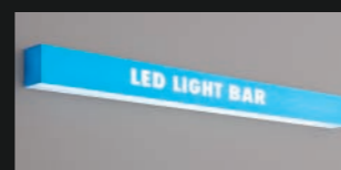
Backlight Illumination Example (CLA12S-CD)